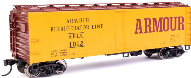
Armour Refrigerator Lines - ARLX 910-41401 #1012 910-41402 #1343 910-41403 #1874 910-41404 #1982