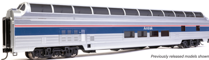
Previously released models shown.