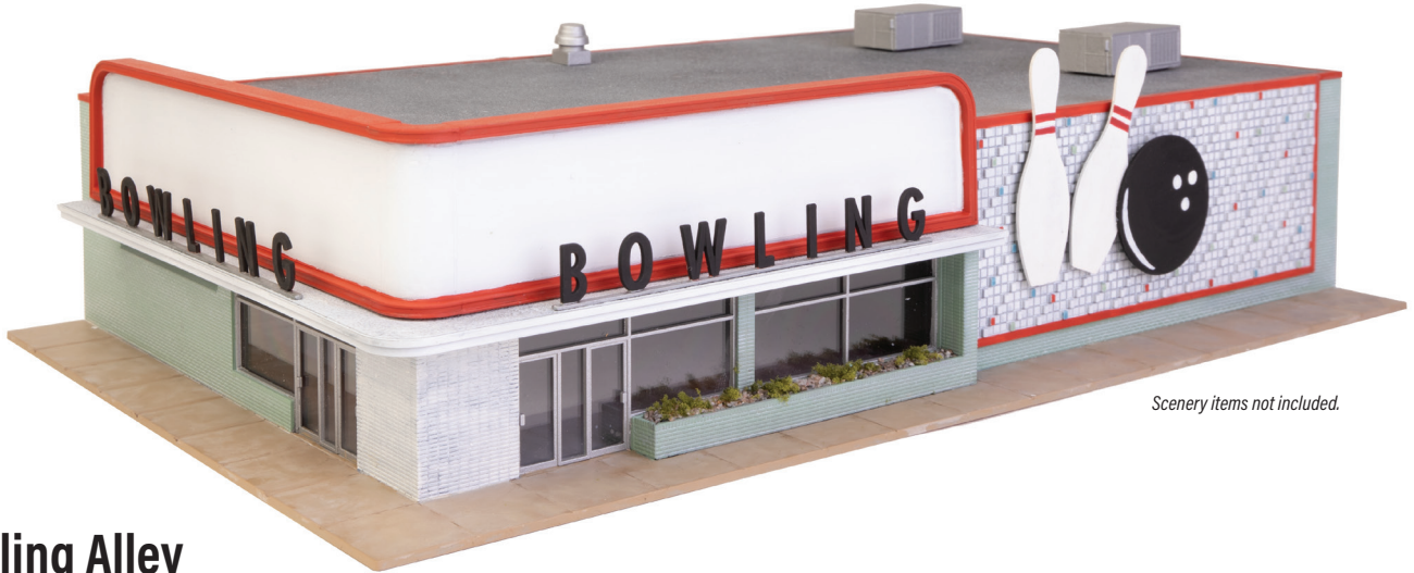
Scenery items not included.