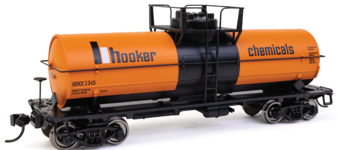
Hooker Chemicals - HOKX

910-48405 #809 910-48406 #818 910-48407 #822 910-48408 #829