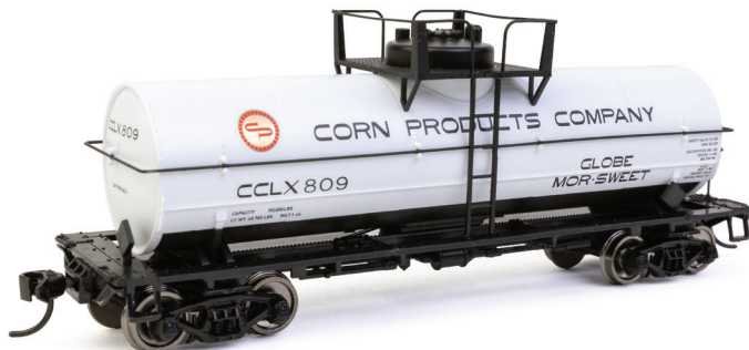
Corn Products Company - CCLX

910-48409 #19606 910-48410 #19615 910-48411 #19639 910-48412 #19696