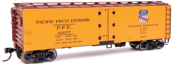
Pacific Fruit Express 1 - Overland logo 910-41413 #40077 910-41414 #40265 910-41415 #40428 910-41416 #40698