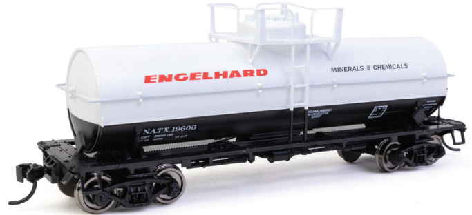
Engelhard Minerals & Chemicals - NATX

910-48401 #20002 910-48402 #20010 910-48403 #20017 910-48404 #20020