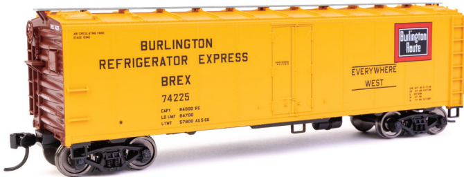
Burlington Refrigerator Express - BREX 910-41405 #74225 910-41406 #74269 910-41407 #74360 910-41408 #74398