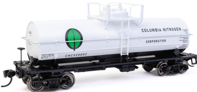
Columbia Nitrogen - CNCX

910-48401 #20002 910-48402 #20010 910-48403 #20017 910-48404 #20020