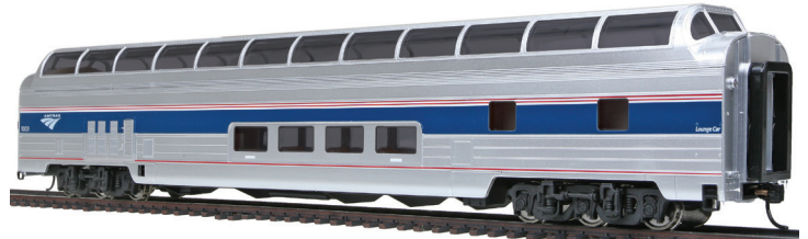
Previously released models shown.