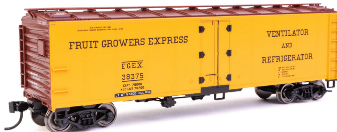
Fruit Growers Express - FGEX 910-41409 #38375 910-41410 #38383 910-41411 #38450 910-41412 #38484