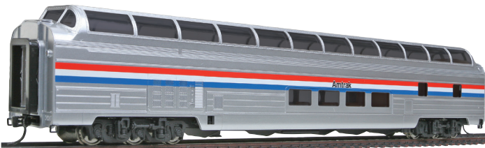
Previously released models shown.