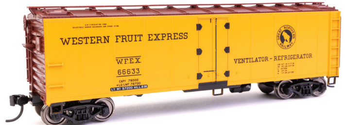
Western Fruit Express - WFEF Great Northern logo 910-41421 #66633 910-41422 #66686 910-41423 #66703 910-41424 #66750