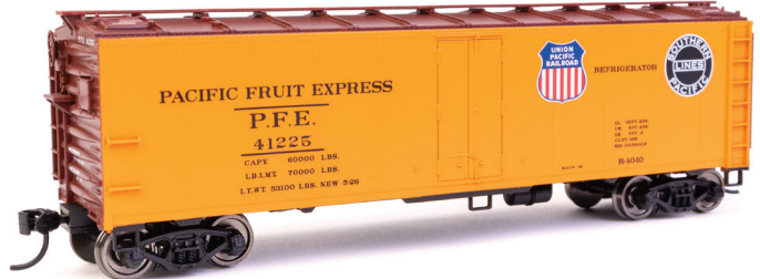
Pacific Fruit Express 1 - Union Pacific 1 /Southern Pacific 1 logos 910-41417 #41225 910-41418 #41430 910-41419 #41507 910-41420 #41698