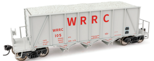
Western Railroad - WRR 920-106046 #105 920-106047 #141 920-106048 #207

These items are subject to Walthers MAP policy. 5/29