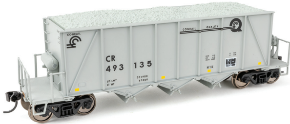
Conrail 920-106031 #493135 920-106032 #493157 920-106033 #493186