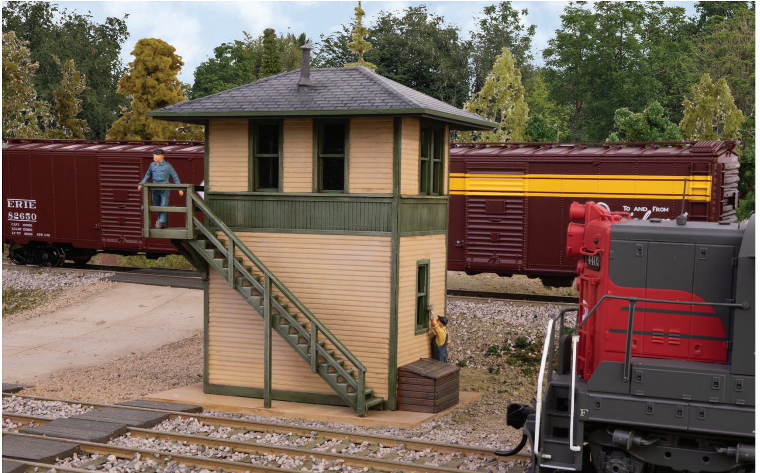
Figures, vehicles, railroad equipment, and scenery items not included.