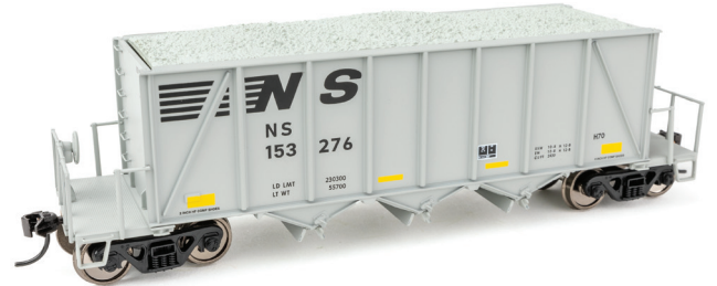
Norfolk Southern 920-106043 #153276 920-106044 #153388 920-106045 #153397