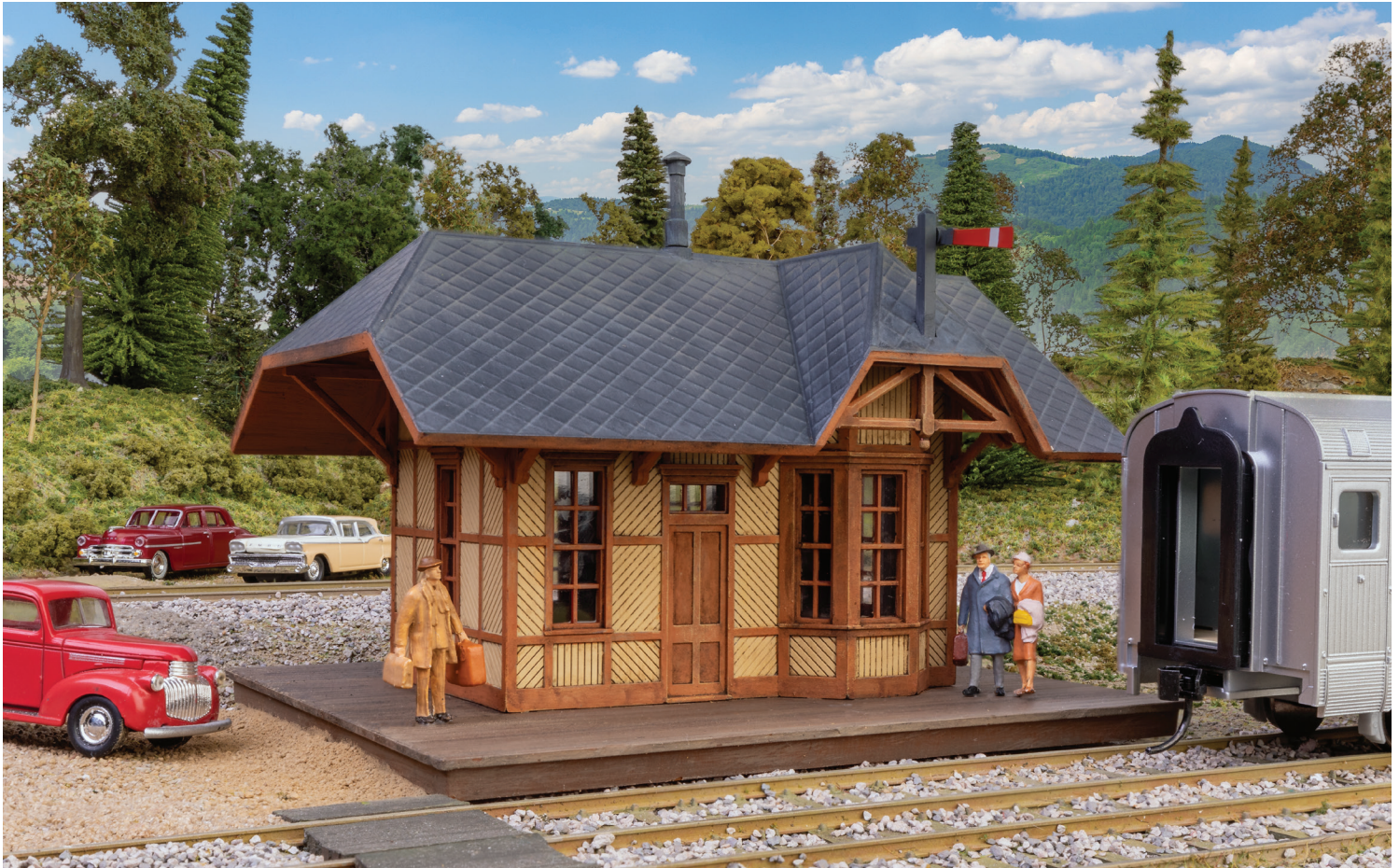
Figures, vehicles, railroad equipment, and scenery items not included.