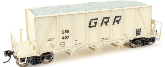
Georgetown Railroad 920-106040 #407 920-106041 #411 920-106042 #436