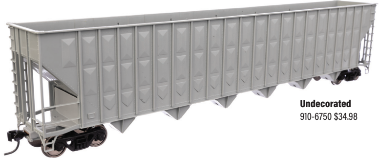
Undecorated 910-6750 $34.98