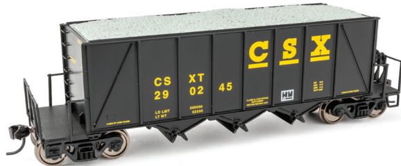
CSX Transportation 920-106034 #290245 920-106035 #290261 920-106036 #290272