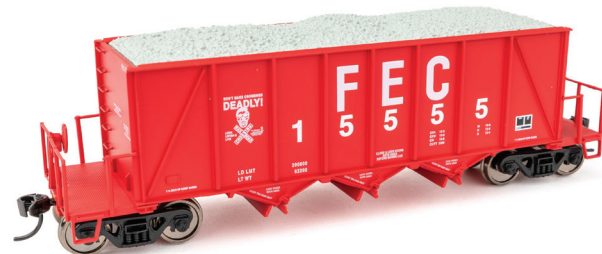
Florida East Coast 920-106037 #15555 920-106038 #15725 920-106039 #15784